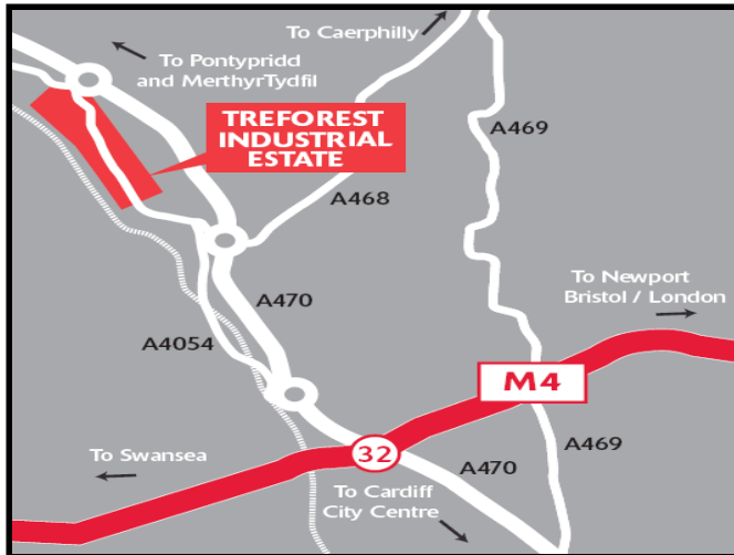
Not to scale – for identification purposes only