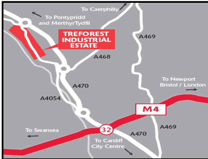
Not to scale – for identification purposes only